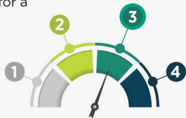
Phase 3: Creating Clarity

For the latest info about UBC's Senior Pastor Transition, visit ubc.org/transition . There you will find information about the entire transition process. You can meet the new Transition Team that will guide us through a Congregational Self-Study and prepare the necessary content for a Congregational Profile. This profile will be critical to the work of a Search Committee that will be elected near the end of this phase. Please stay informed and stay connected during this important time in the life of UBC.